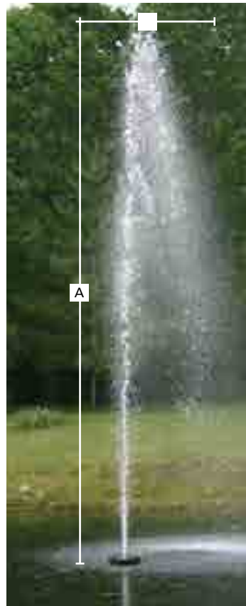
Sky Cannon A dramatic single plume of water