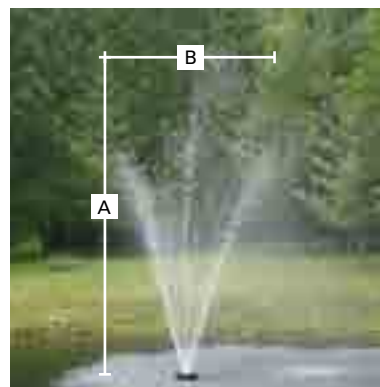
Water Trumpet A symmetrical inverted bell shape