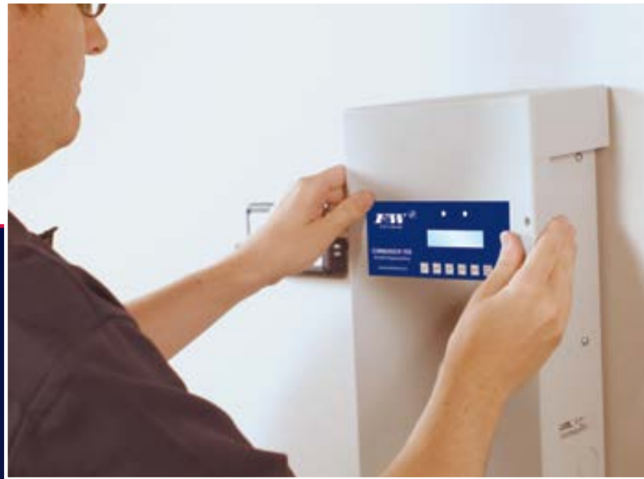
■ Easy to install and set up

The Commander Pro series by Flint & Walling simplifies Variable Frequency Drives and provides consistent water pressure regardless of demand. Unlike most drives, the Commander Pro is easy to install, set up and maintain. When combined with Z Control ® , contractors can monitor, access and even control the drive via the app or website from anywhere in the world. That means you can remotely monitor performance, diagnose problems before your customers are even aware of them and fix non-critical issues without ever leaving the office. All from Flint & Walling, a family-owned American manufacturer of premium pumps, motors and controls.